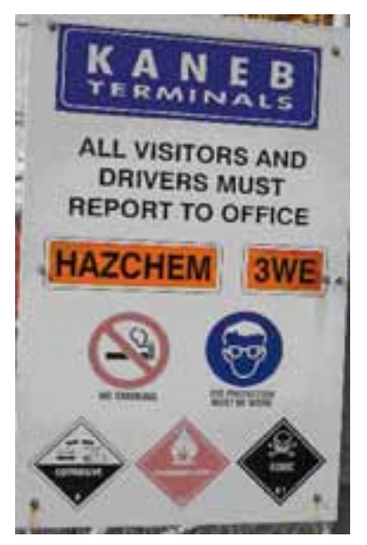
Black TOXIC diamond.

Signage for premises and tanks then should be easy to get correct you would think, but think again. Here are some examples of sites with a twist on interperation of what the signs should look like. These are but a few of many around the country that I think all test certifiers and enforcement officers would come across.