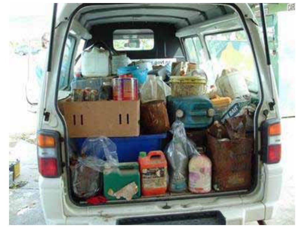
Assortments of old part-used chemicals and empty containers are not unusual after a rural 'spring clean'.

For full details of Agrecovery Container collection sites nationwide and a list of participating brand owners, visit <u>www.</u> <u>agrecovery.co.nz</u> or freephone 0800 247 326.