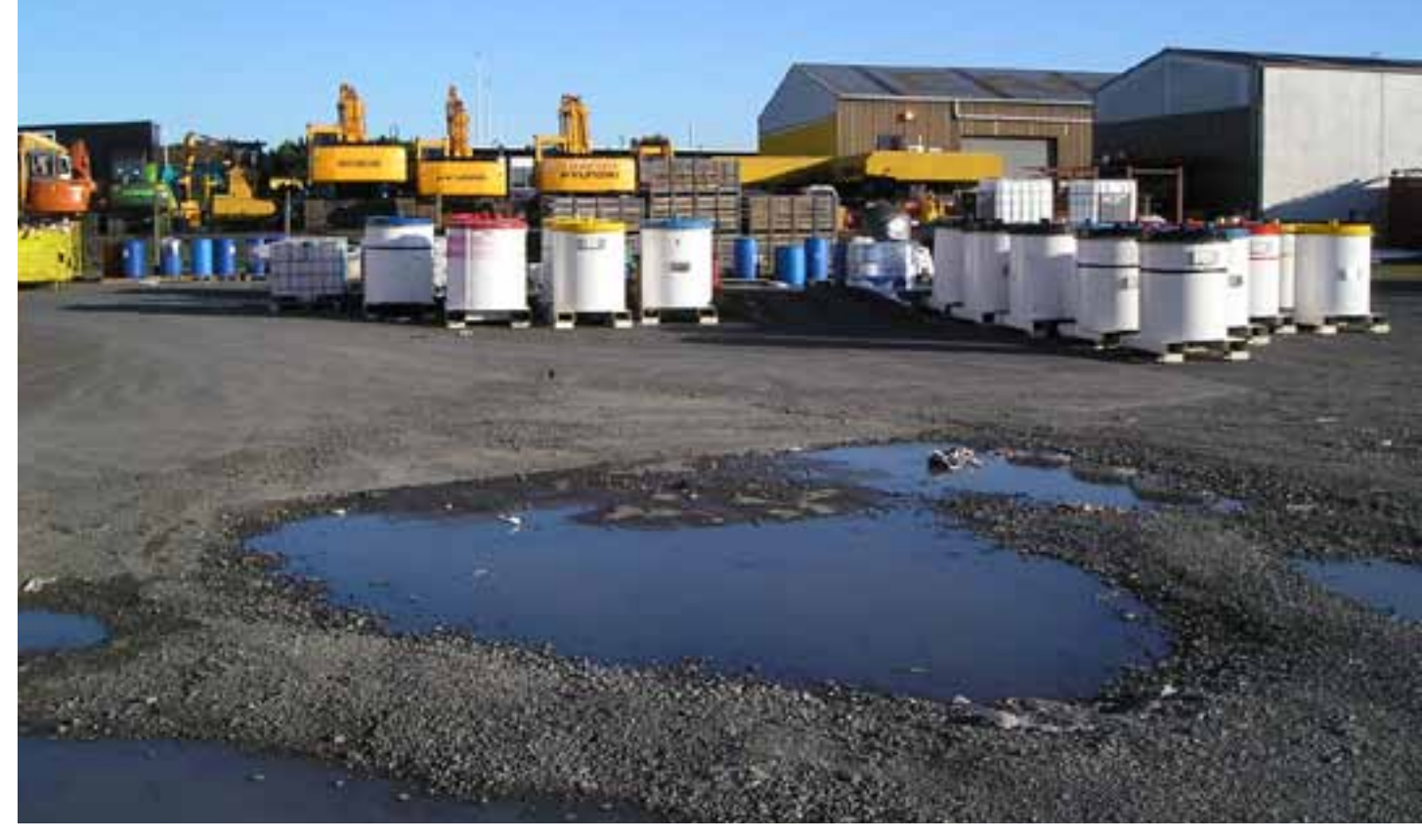
A platoon of IBCs waiting for bund or swim.

you didn't see that one. But in essence, this implies that IBCs are not stationary tanks.