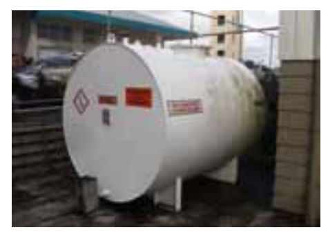
Diesel tank showing NON-HAZARDOUS CONTAIN SPILLAGE on side and a ECOTOXIC diamond on the front, at least the correct diamond is showing.