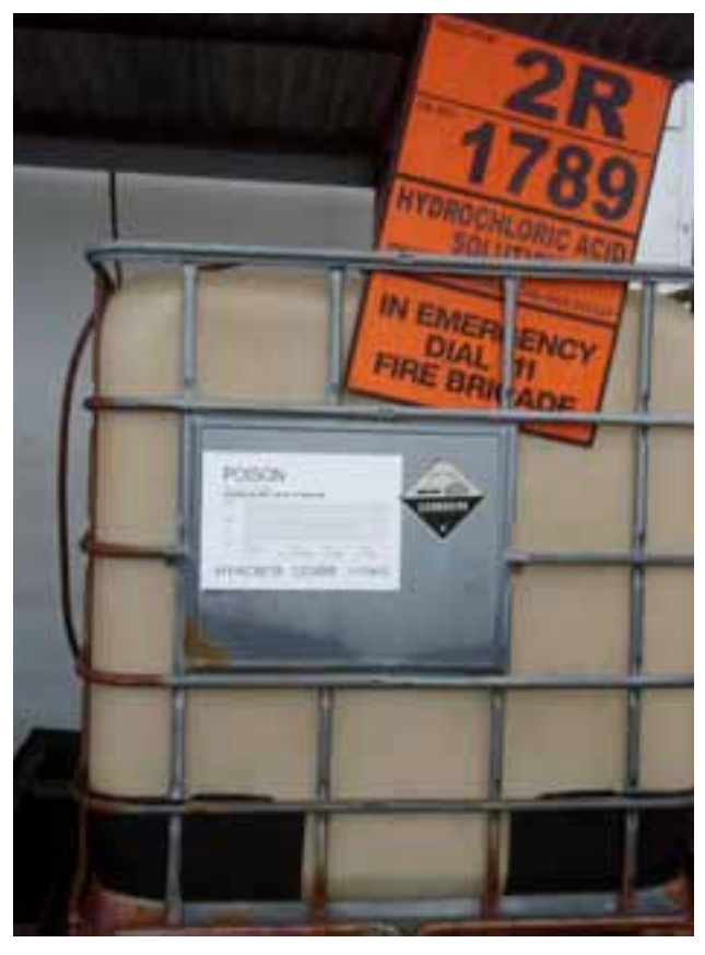
Senior IBC hopefully nearing retirement.

That being the case, the treatment of the existing IBCs can be as follows: