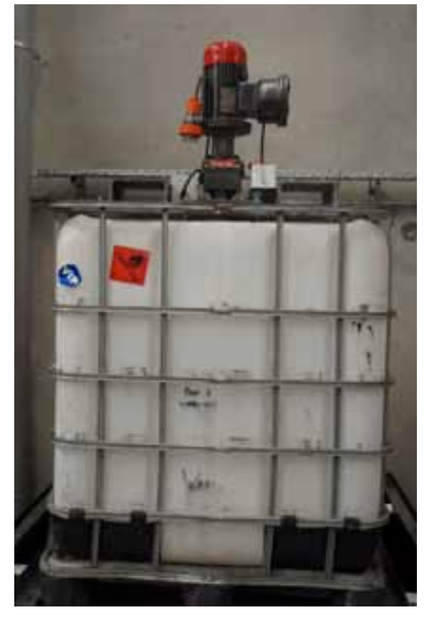
IBC used as a mixer.