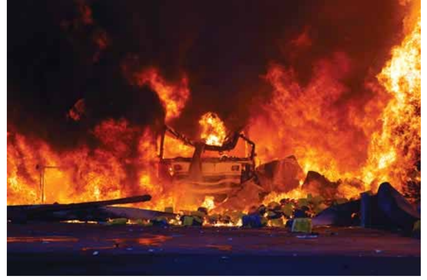
The fatal Icepak Tamahere explosion and fire was a recent viloent example of the consequences of explosive atmosphere igniting.

The documents specified in parts (a) and (b) of this regulation are no longer current, and the recent ratification of AS/NZS 60079.10.1 gives approval for its use under part (c). There is no requirement under